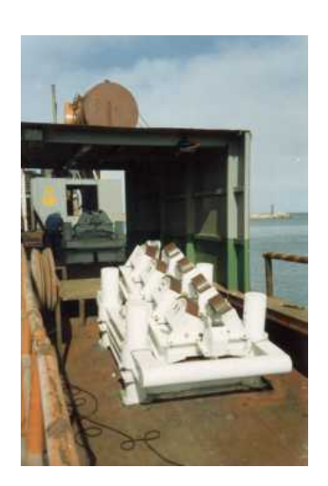
8 Rollers conveyor.