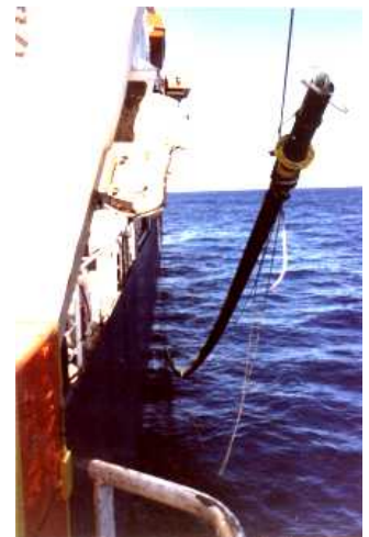
The corer alongside the ship.