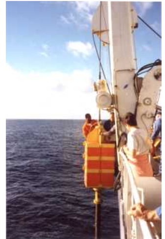
On board the Marion Dufresne.